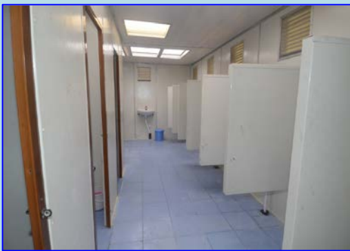
INTERIOR OF THE BOYS TOILET