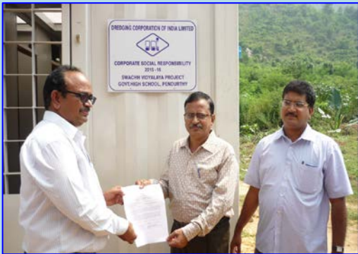
08/10/15 – GHS PENDURTHY