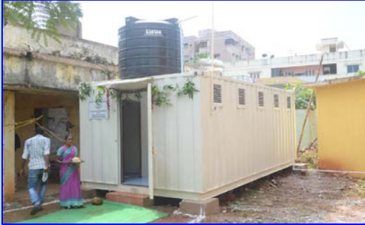
EXTERIOR OF THE PORTA CABIN CONTAINER TOILET