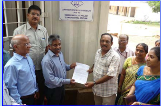
9/10/15 – ZPHS - SONTYAM