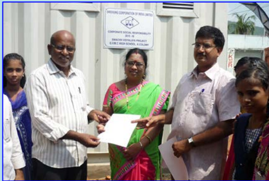
17/10/2015 – GVMC – K. COLONY (BURMA COLONY)