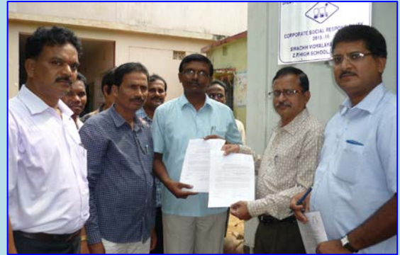
08/10/15 – ZPHS – JUTTADA