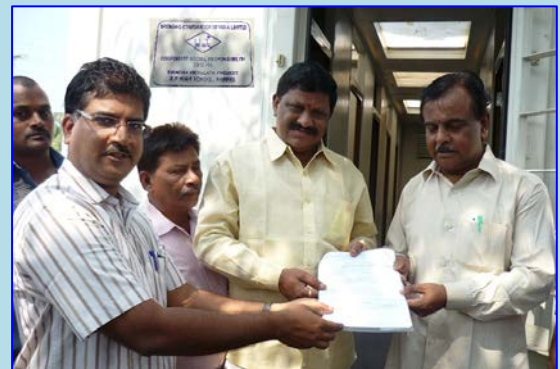
26/10/15 – ZPHS - NARAVA