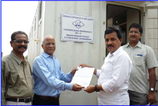
09/10/15 – ZPHS ANANDAPURAM