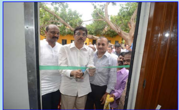
21/8/15 OPENING OF ZPHS (B) GOPALAPATNAM